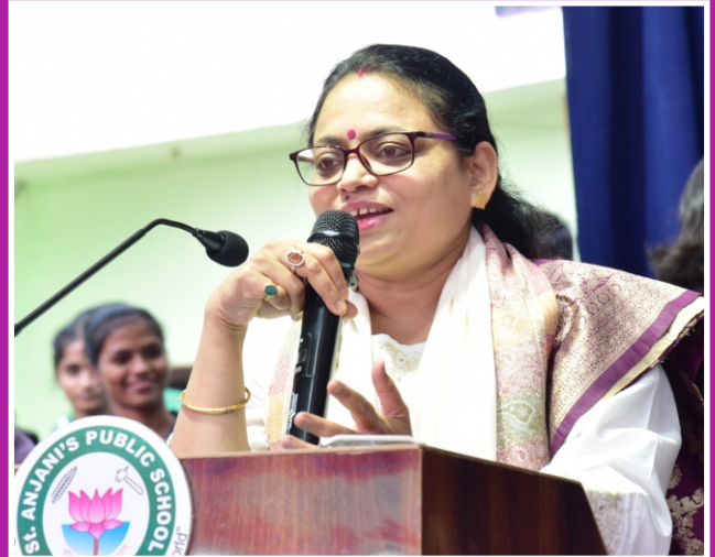
Dr. RITU KARIDHAL, ROCKET WOMAN OF INDIA & OUR EX STUDENT AT OUR SCHOOL